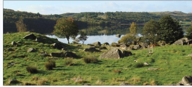
Site 96, Norway, grazing land (Gr)